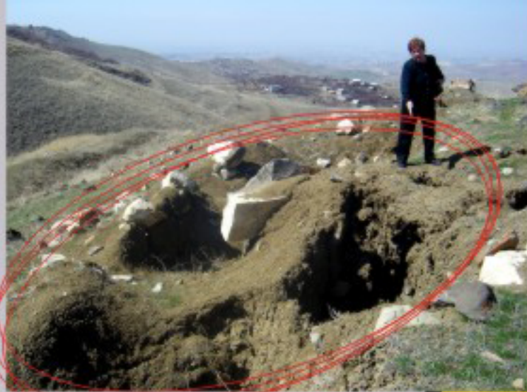
New consequences of the landslide activation

renewal of drainage, fencing of the burial site territory, drainage of mineral waters from springs that are located in the main part of the landslide), nevertheless, the activation of the landslide in the adjacent area of the burial site has led to new crumbings. It testifies that the measures accomplished in the burial site are not sufficient to solve the problem of security of the mentioned site. The further activation of landslides can seriously threaten the contamination of water of the nearby area of the burial site and the trans - boundary waters.